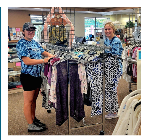
The church youth group did a day of service at the Forest Lake Thrift Store. "We love giving back to the community and helping out Family Pathways."