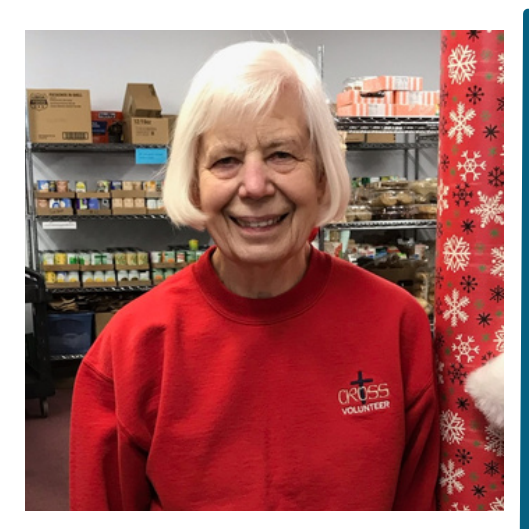
Spotlight Winner Food Access

"We are good buds! We both love cars! He and I both love classic cars, and I have two businesses in sprint car racing. This love has spawned many conversations."